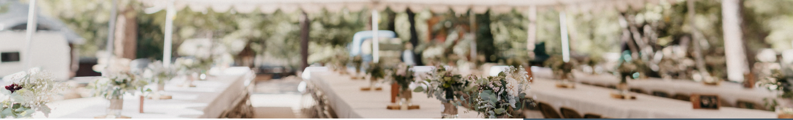
Table Settings & Decorations